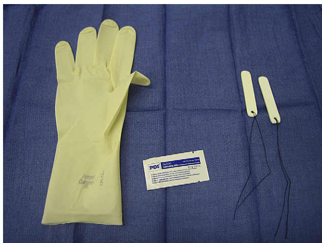
Figure 1 A standard, sterile, size 8 latex gloves, KY jelly and Merochel packs used for nasal packing.

A standard, sterile, size 8 latex gloves has the index and middle fingers cut off en bloc as shown (Figure 1). Merochel packs are introduced into each finger (Figure 2). The outsides of the glove fingers are smeared generously with KY Jelly and the packing inserted into the nasal cavity. Using a syringe and a blunt drawing-up needle, the Merochel packs are then moistened within their fingers causing expansion and tamponade. The bridge of latex between the fingers acts as a safety preventing intranasal migration of the packing, but this can be further reinforced by the traditional tying of the strings of the Merochel packs (Figure 3). At time of removal, there is little or no crusting of dried blood to the packing assembly and the whole unit can usually be slid out of the patients' nose with virtually no discomfort.